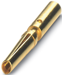
Crimp contact, turned, contact diameter: 0.8 mm, crimp range: 0.08 mm 2 ... 0.25 mm 2

Please be informed that the data shown in this PDF Document is generated from our Online Catalog. Please find the complete data in the user's documentation. Our General Terms of Use for Downloads are valid ( http://phoenixcontact.com/download )